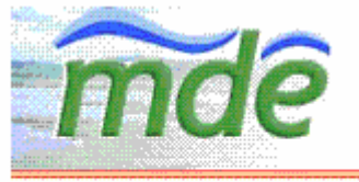
Maryland Department of the Environment